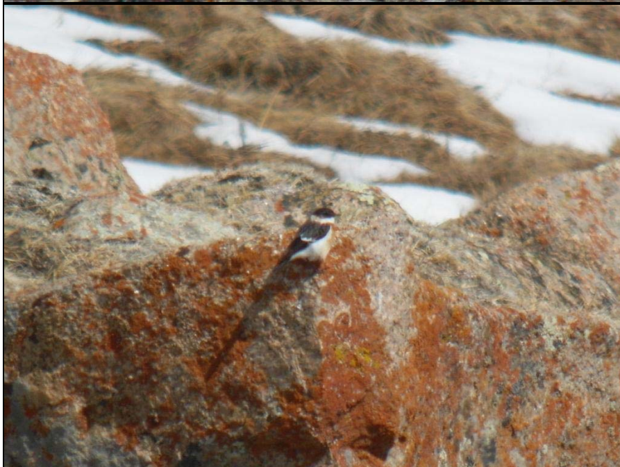
The best bird of the trip if you look at ranking as rare with Birdlife standards.