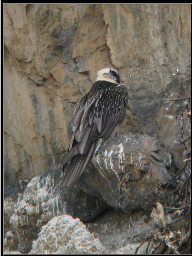
One adult, near a nest (right of it) by Dave Williamson

A total of 19 seen spread over the trip, very nice views. The adults where very pale. One nest visited.