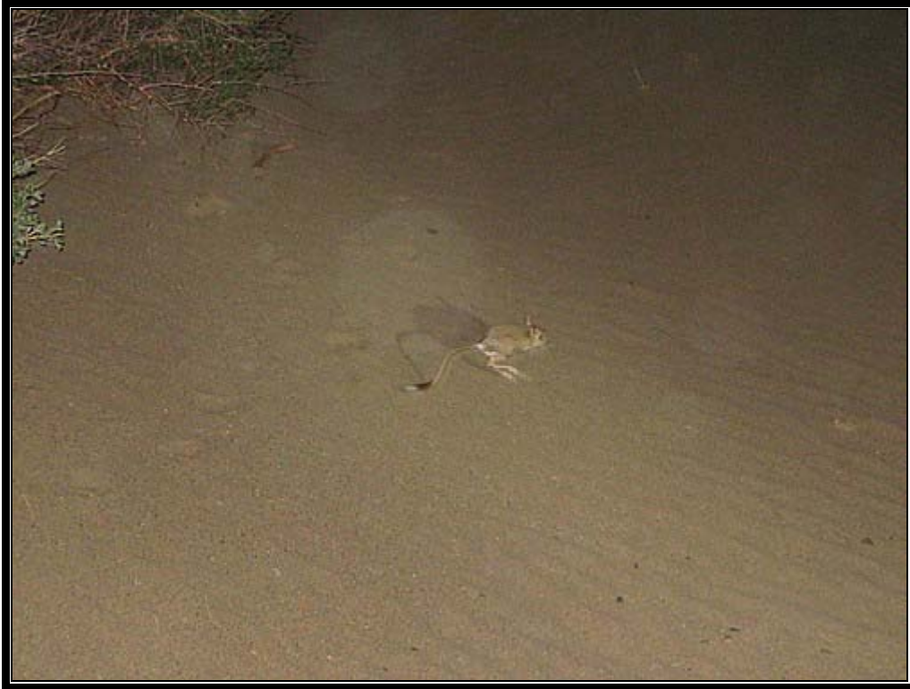
A very tame mammal walking right up to our boots at one time

Mid-day Jird (Mid-day Gerbil) Meriones meridianus : This one showed quite well, just after dawn at the Henderson's Ground Jay spot.