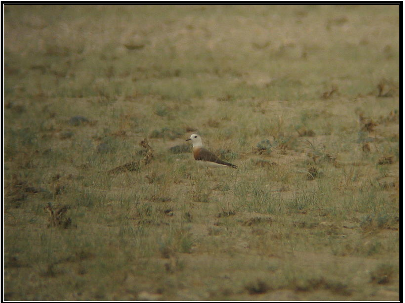
Oriental Plover, Gobi, Mongolia