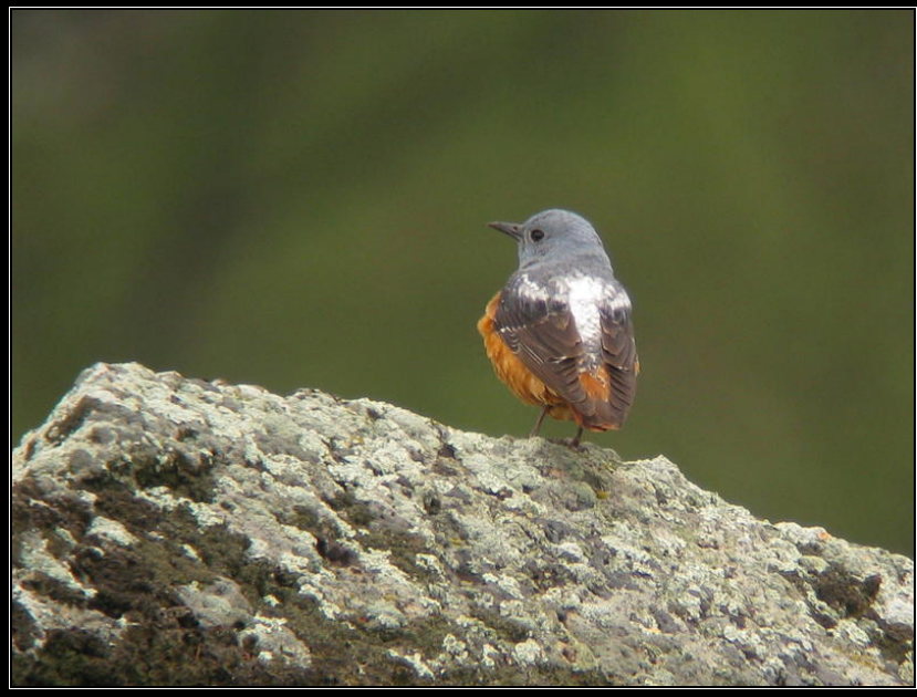
One of the nice males by Dave Williamson

A total of 7 birds seen spread over the trip in the rocky and not to high parts of the visited mountains.