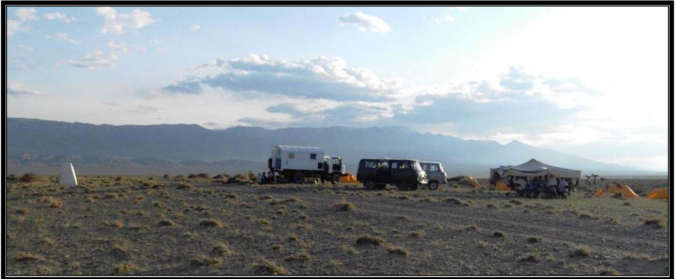
Camping and Henderson's Groundjays from the tent

Map Mongolia: http://maps.google.co.uk/?hl=en&ie=UTF8&t=h&ll=47.100045,103.183594&spn=21.735117,38.320312&z=5