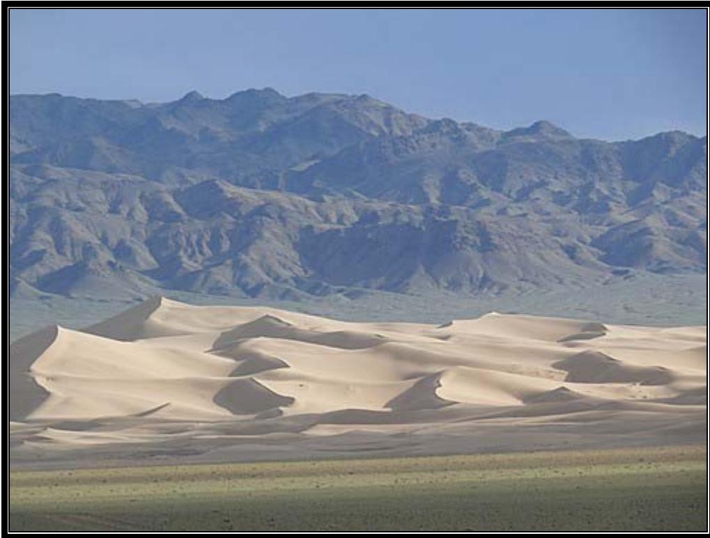
Two extremes, lovely sand dunes and snowy mountains, four season's in a day is not rare in Mongolia