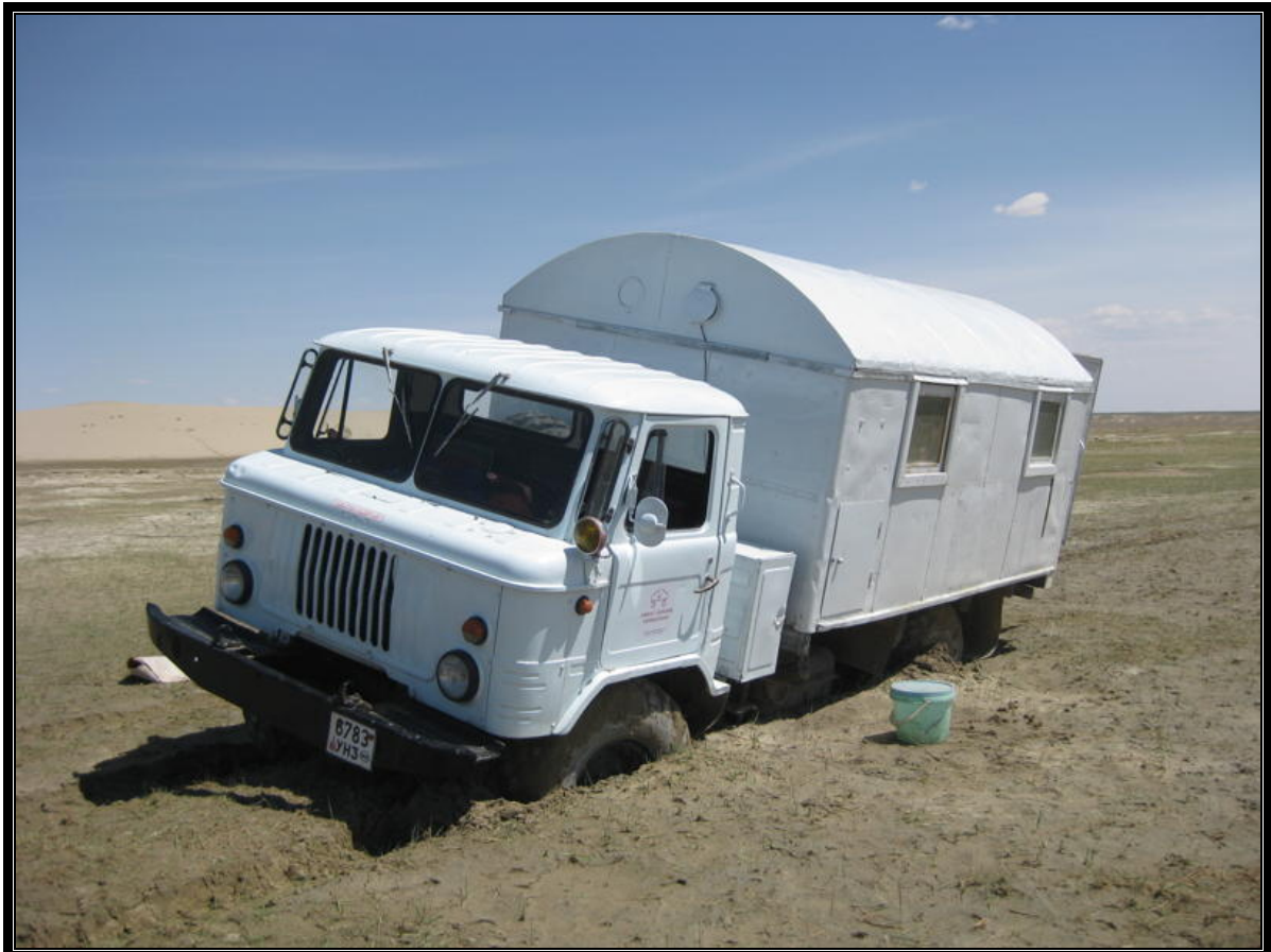
Travelling in Mongolia is not without problems, here the kitchen truck is in trouble, it took us (only) three hours to get it out by digging the kitchen tent under the car...