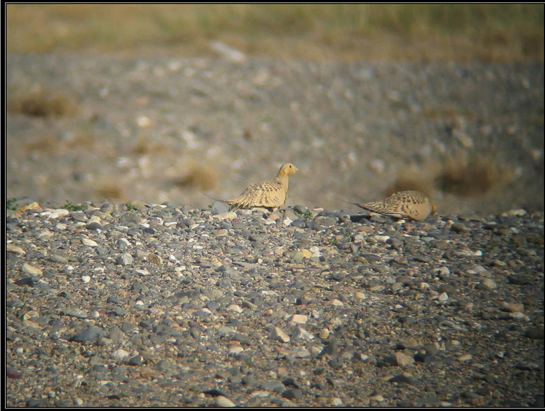
One of the many pairs seen on the trip by Dave Williamson

A total of 294 birds seen on five days of the trip. The most on a day where 200 (01-06). Also seen feeding (in front of my tent in the evening) and drinking where one male was observed “filling up” its belly feathers.