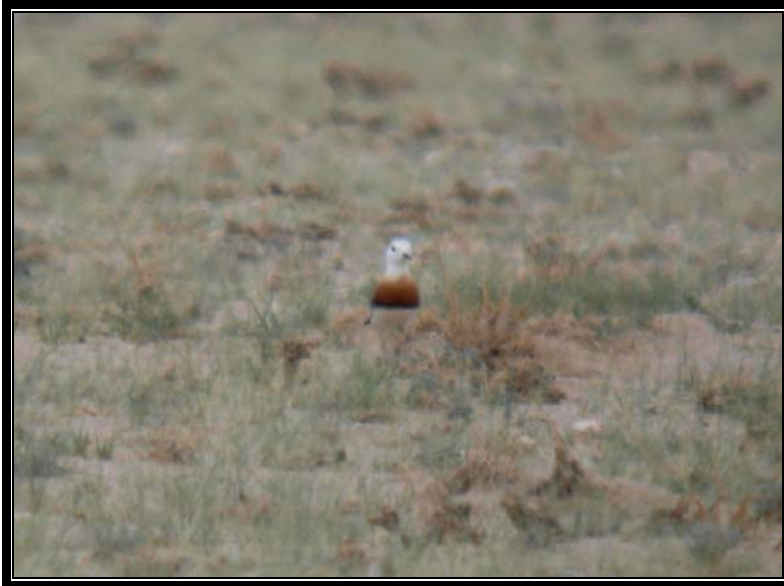
Spooky headed Plover could be an other name..

Not an easy bird to find, but after seeing it well we stopped looking for it. The display flight was impressive like a slow wing beating shearwater above the desert, showing the dark underwings.