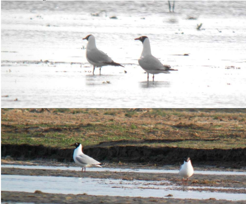
One of the birds of the trip.

Seen and studied very well, not too hard to pick out from the Common Black headed Gulls (bigger, whiter, more black head coming down further in the neck and more obvious white eyelids). Also the way of feeding is different walking with the neck stretched.