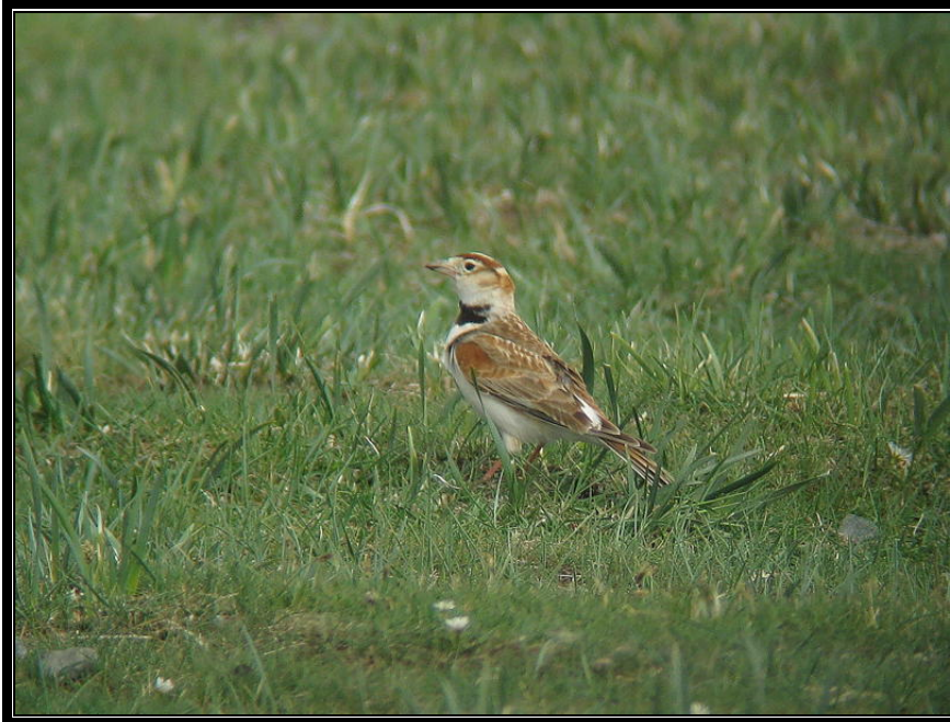
Common in the steppe's and big

Common in the steppe area's north of the Gobi, with more than 50 a day.