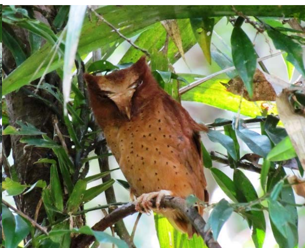
No dip on the Serendip at a day roost