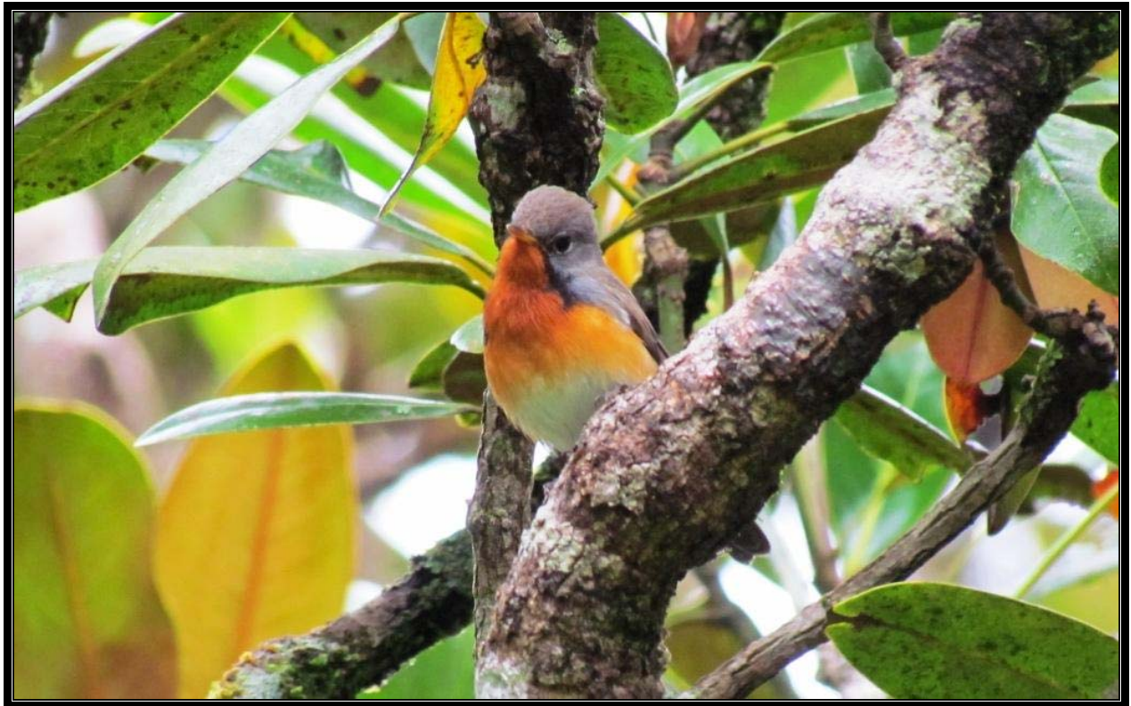
Kashmir Flycatcher at Hakgala Gardens, a good photographic opportunity for this hyper active species.

This is a small report from a special trip to see a few special Holarctic species wintering or occurring on this beautiful island.