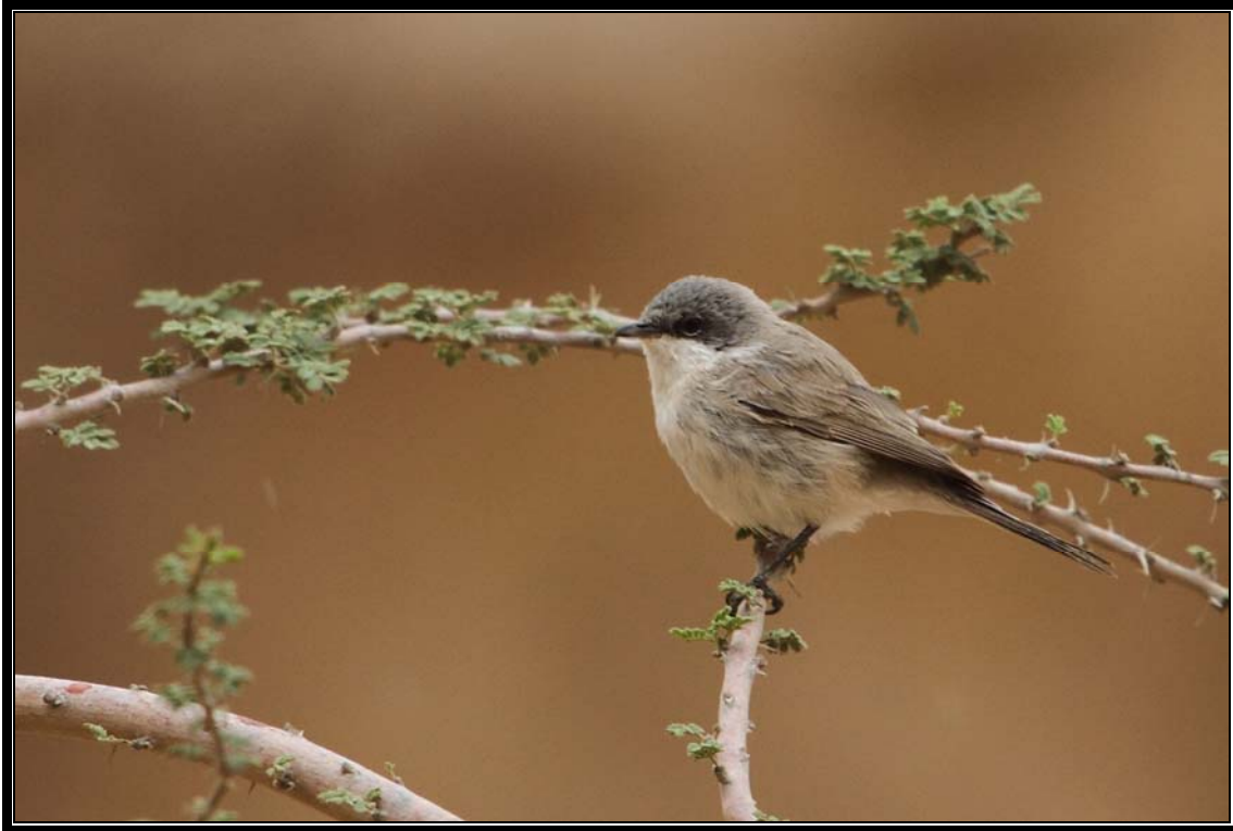
Lesser Whitethroat spec, in song considered Hume's, not in my opinion

About 10 birds seen spread over the trip. All birds looked like the bird pictured and had a Bluetit like call. This particular bird was accused of being a Hume's (Lesser) White Throat by two leaders of Birdfinders on song..