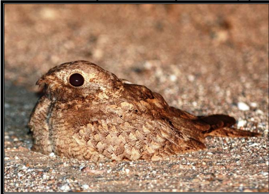
One of the gypo's by Steve James.

02-02 2 ex., seen very well in the evening (after dusk) at AW Camel track. One bird was seen on the ground several times and one bird seen very well flying for 15+ minutes above some lights of an advertisement board. A pale quite unmarked bulky nightjar, with on one bird pale grey “spots” in the undertailcorners. The other bird had white throat/moustache patches, divided in two parts, seen when flying over.