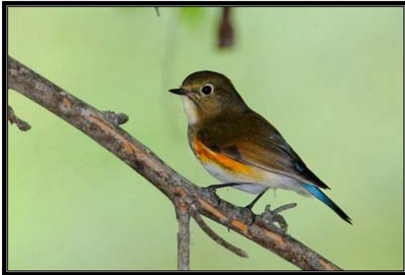
The Bluetail by Khalifa Al Dhaheiri

03-02 1 immature male (because it song) at MPG. Seen very well, the second for the UAE (I by accident also saw the first)