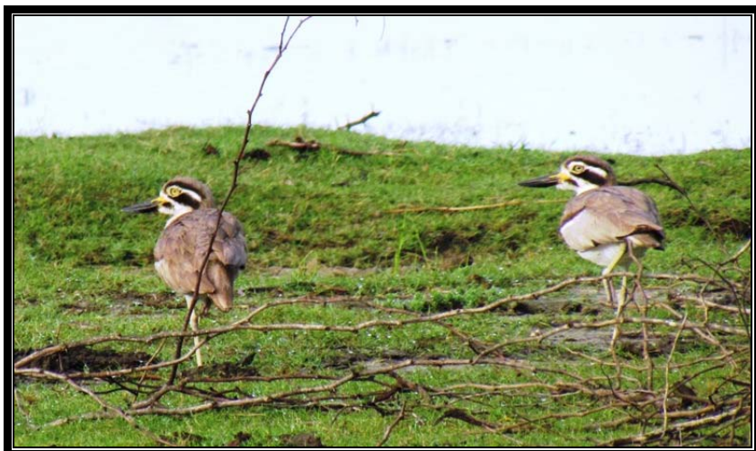
Great Thick-Knee, at Bundela finally added to the list