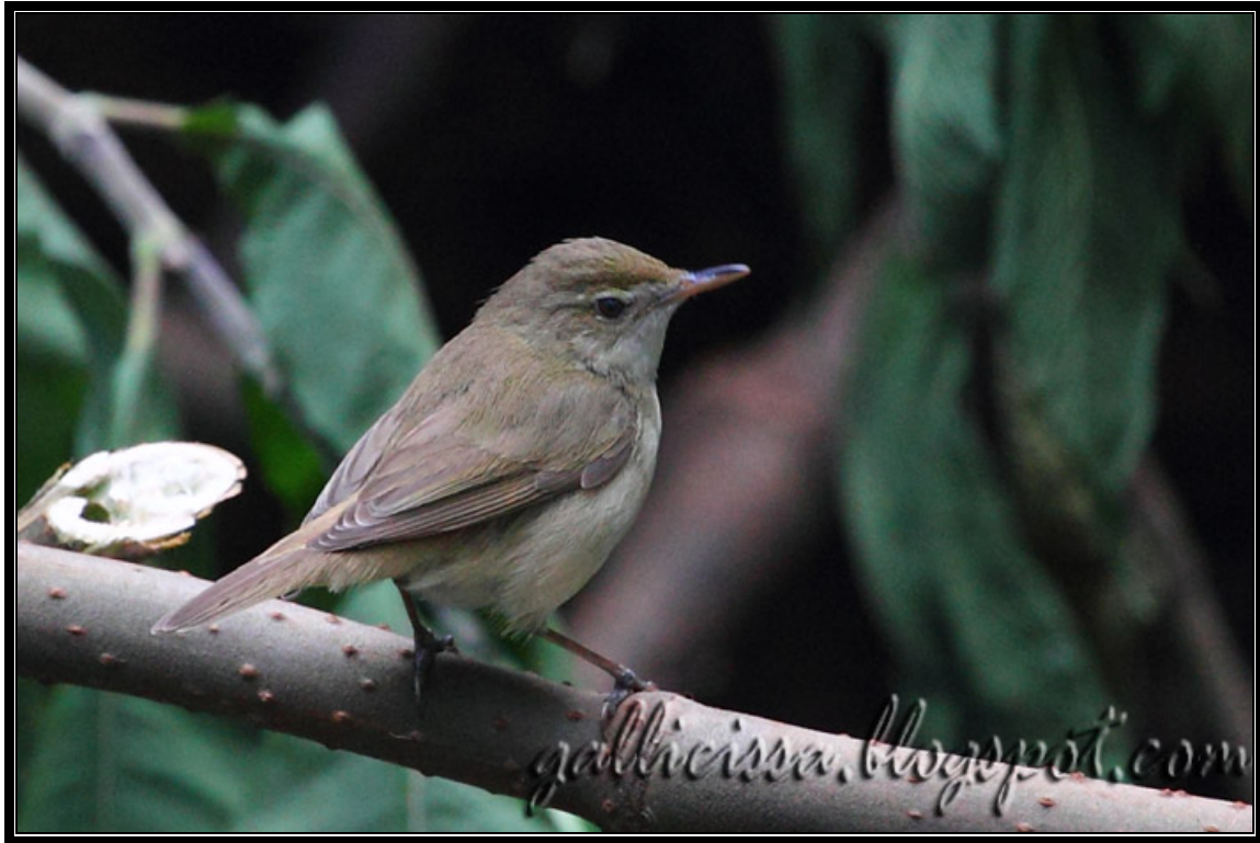
A bird thought to be a Sykes warbler, I probably saw this bird but this one was photographed by Amila Salgado twenty days later