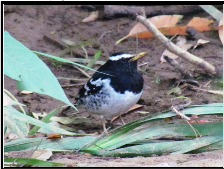
Mother all thrushes, a male Pied Thrush along the stream in Victoria Park