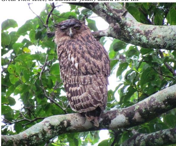
Brown Fish Owl, I expected them darker at this part of the world