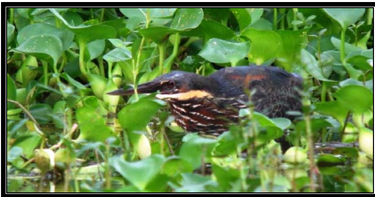
Male Black Bittern, the first I saw.

Common throughout the trip 08-02 15 ex in one flock at Bundela during the jeep safari, in winter plumage 06-02 10 ex. in pairs at Sinharaja 09-02 10 ex. seen often in pairs along the way up to Nuwara Eliya + 11-02 1 ex. along the way A total of 8 birds seen on three days in the lowlands The commonest drogue seen on almost every day, often associated with birding flocks 07-02 6 birds seen with birding flocks at Sinharaja 05-02 5 ex. on a wire along the way. 06-02 7 ex. seen very well at several centimetres at the terrace of the lodge in Sinharaja Common throughout the trip Common throughout the trip