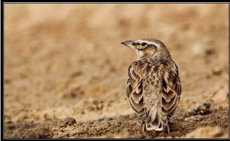
One of the birds

02-02 3 ex. at the Al Wathba Camel track, great views and a good bird in the UAE.