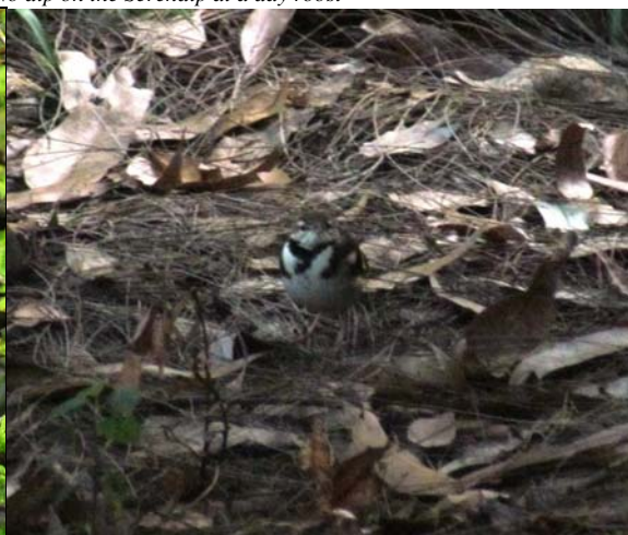
Forest Wagtail allways hard to photograph at Victoria Park