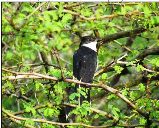
Missed in the UAE two years ago, easy in Bundela, Pied Cuckoo