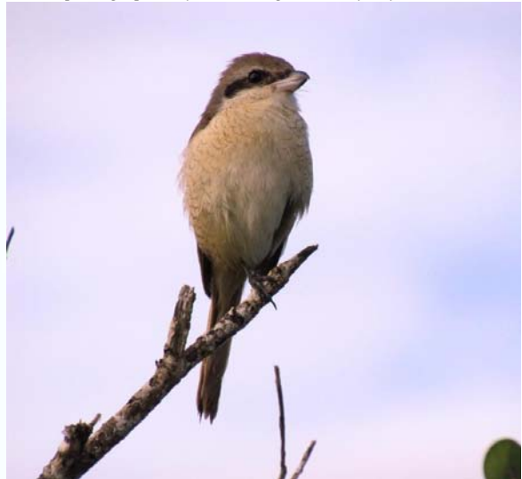
Blyth's Pipit, not easy to ID from the buff Paddyfield pipits there. Quite pale Brown Shrike's in my opinion, this one at Bundela.