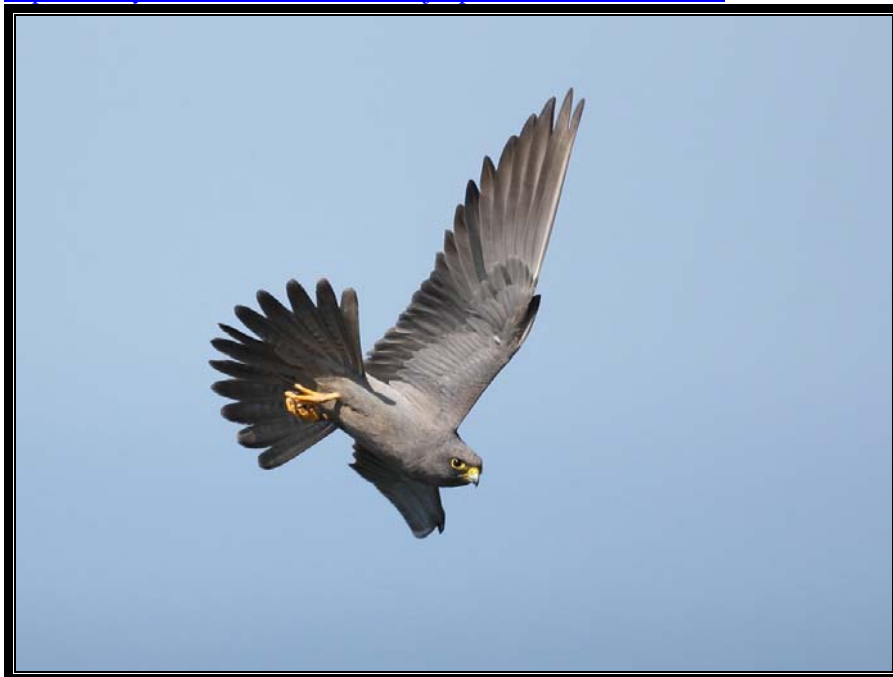
This bird was photographed on the first day by Jens Eriksen

http://www.youtube.com/user/maxberlijn#p/a/u/1/-hW0XK3KGU0