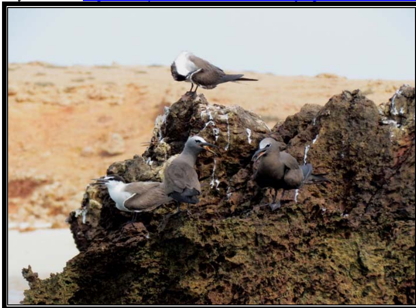
They where very tame..

04-09 17 birds in a Bridled Tern colony seen very well and very close, with a quite broad bill base and reddish “mouth”. Some birds where sunbathing with stretched out wings. There tong's where hold in a typical triangular way. See also: http://www.youtube.com/user/maxberlijn#p/a/u/0/daaNia-W8iE