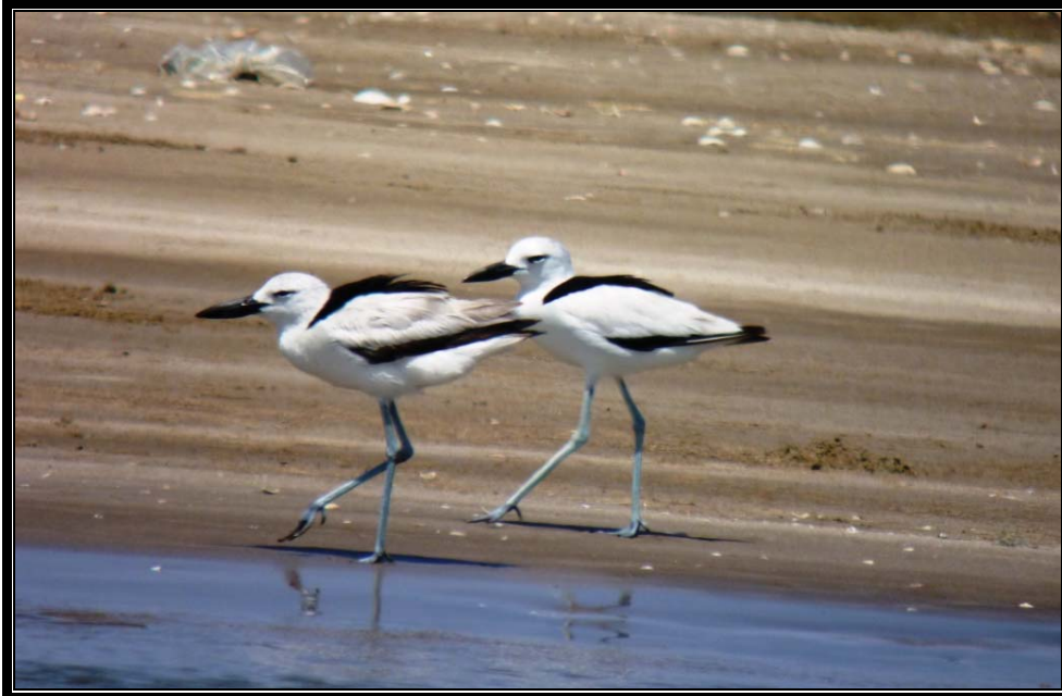
A good start these tow Crab Plovers

03-09 2 ex. at 2.1 and 05-09 8 ex. all on the beach with a few immatures.