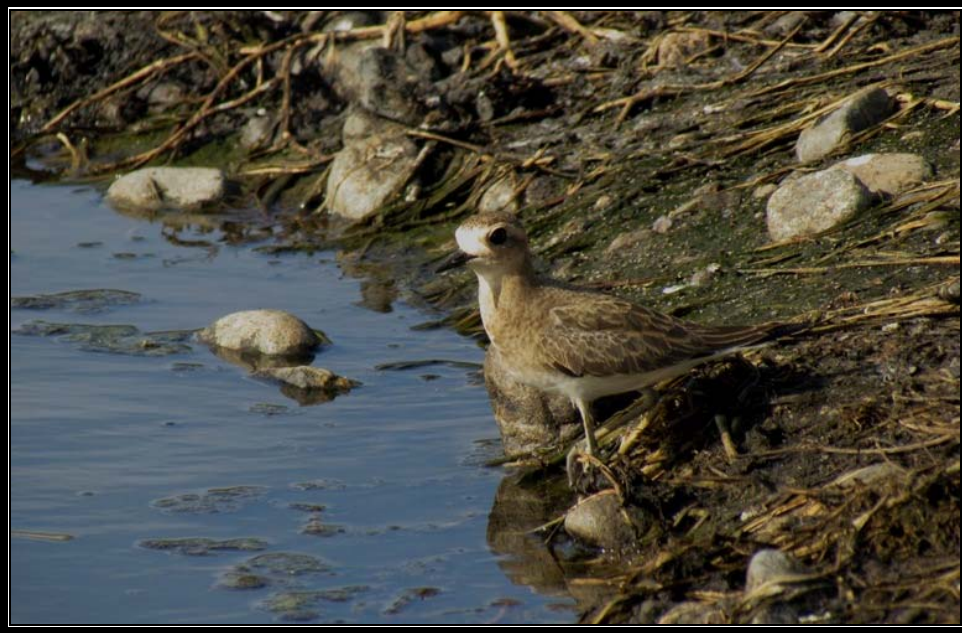
The immature bird

05-09 3 ex, two adults in non breeding plumage and one immature (based on breast band color) at 2.2 seen very well at the little ponds and one on a dry area of the farm