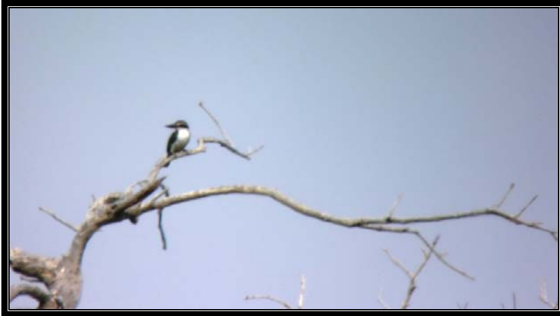
This was the only view we got of the Kalbaensis

05-09 1 ex. sitting quite high up in tree in the mangrove's at 2.4