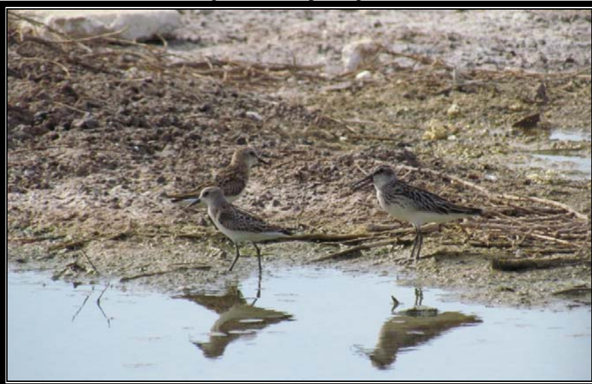
A Broad-Billed still in immature plumage

044 BROAD-BILLED SANDPIPER – A total of 25 seen at several locations, all but one juvenile birds (still fresh), the adult was moulting into winter plumage.