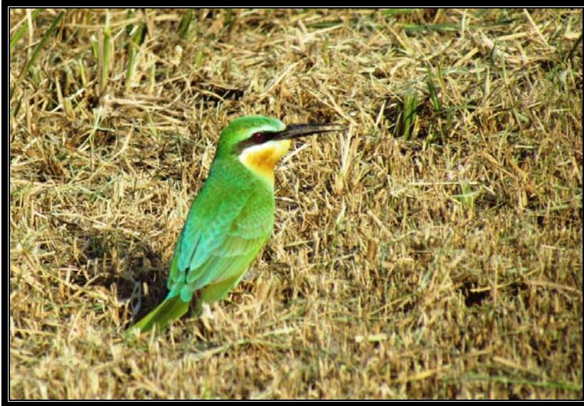
A fresh immature Blue-cheeked very common at Sun Farms

081 BLUE-CHEEKED BEEATER – About 90 birds seen with many immatures, mainly at 2.2 where they were showing very well, also the adults were freshly moulted.