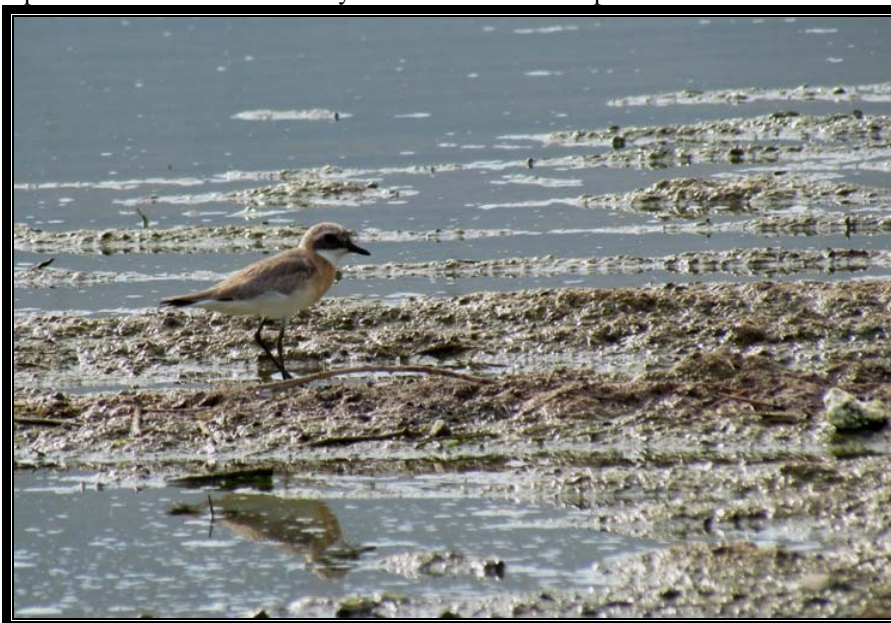
One of the summer plumaged birds, note the unmarked flanks

Commonly seen during the trip, some still in nice breeding plumage. Some in winter plumage are tricky to separate from Greater when they are alone and not comparable with other waders.