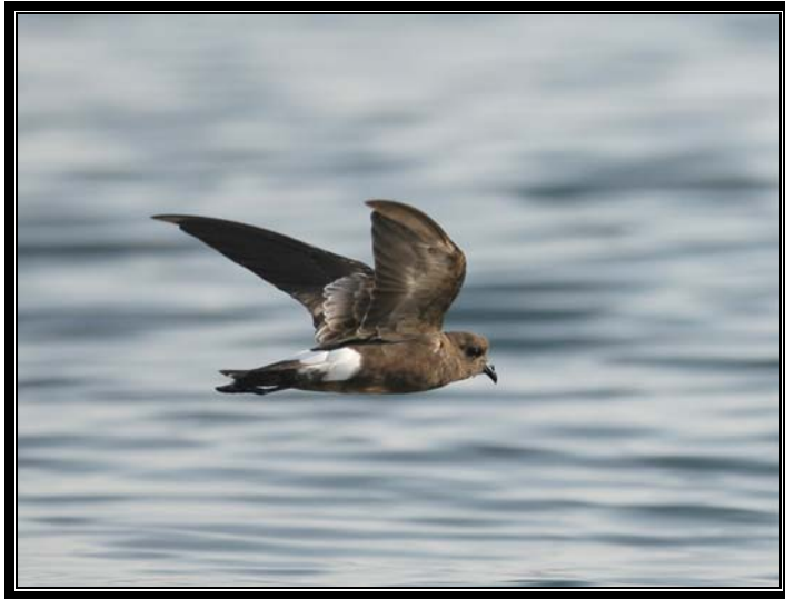
One of the Wilson's by Jens Eriksen, note the wing and body molt

06-09 4 ex, seen quite well mixed in with the Wilson's. A quite large long winged all dark (dark chocolate) stormpetrel, with relatively long wings (compared to the Wilson's they were with). The rump was as dark as the birds where. One bird showed a slight pale upper wing bar, but not very obvious. The forehead was steep and the bill was quite good to see. The birds had the strange habit to fly away from us after we find them (opposite the Wilson's who stayed around). They flew away quite direct low above the water in a straight flight.