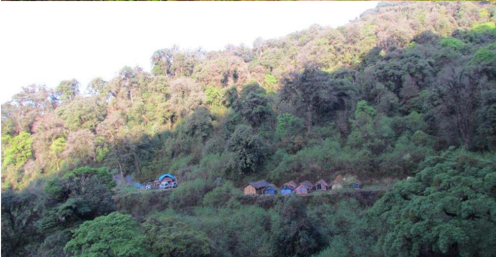
Lama Camp (above) and Sunder-View Camp. Great quite comfortable tents in the middle of the bird action!