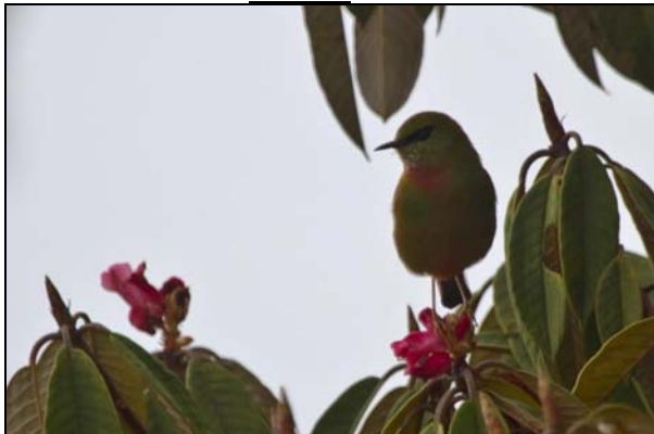
Fire-Tailed Myzornis my number 1 bird