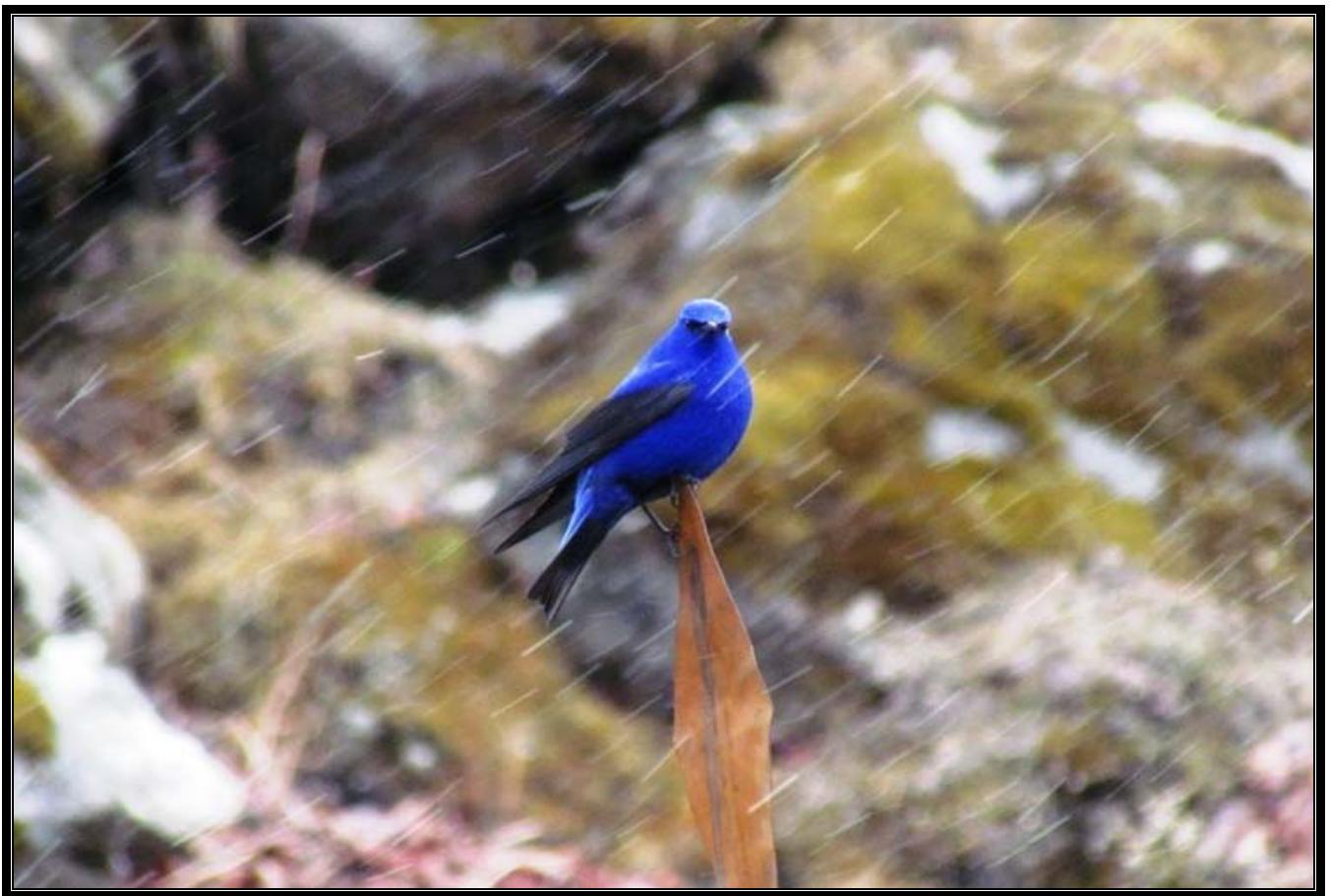
Grandala 20-04 Sela Pass, there is only one blue colour in the world after this bird.