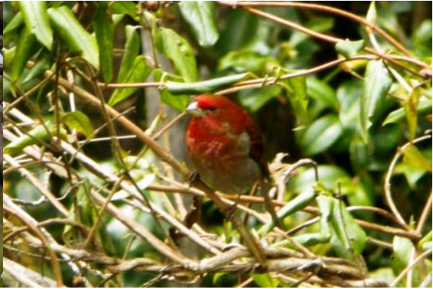
Finally Crimson-browed Finch finally on mu list