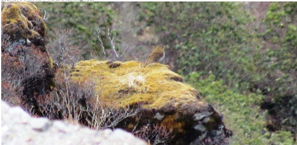
Plain-backed Thrush a great Zoothera