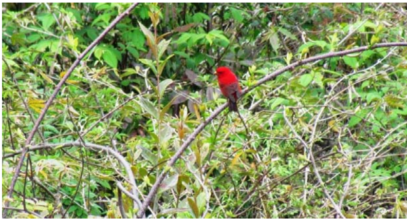
Scarlet Finch now we are talking red!