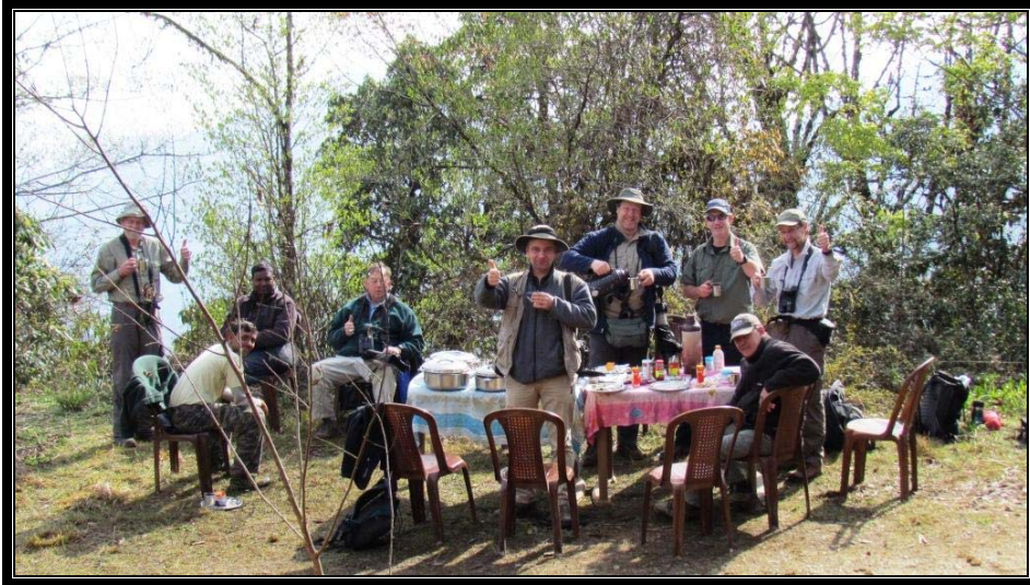
The “Temminck’s trojants” having breakfast after seeing a very fine male Temminck’s Tragopan (see report)