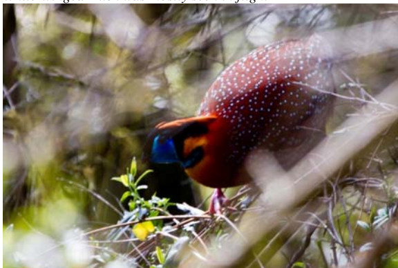
Temminck's Tragopan number 1 bird of the trip