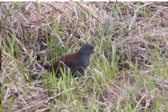
but Black-tailed Crake was also very much wanted..