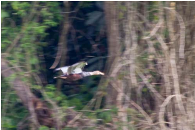
White-winged Duck was mostly seen in flight