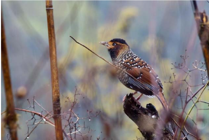
Spotted Laughingthrush one of the most beautiful of its family