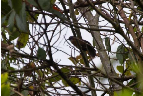
Slender-billed Scimitar-babbler very spectacular