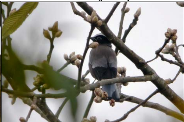
Purple Cochoa an unexpected surprise