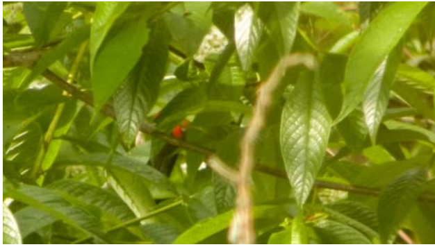
Luckily we SAW Bugun Liocichla much better....