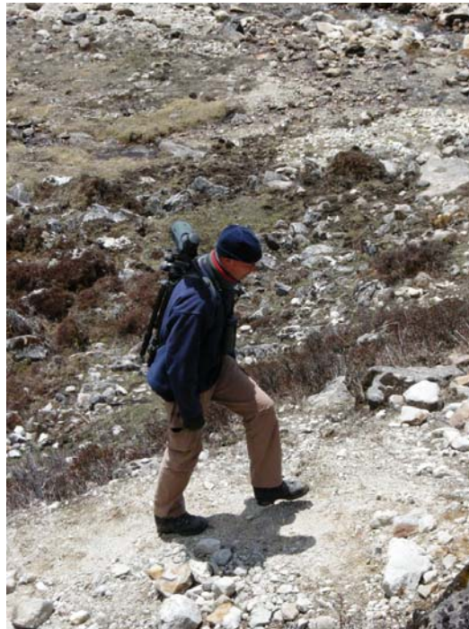
Time for an other trip.....