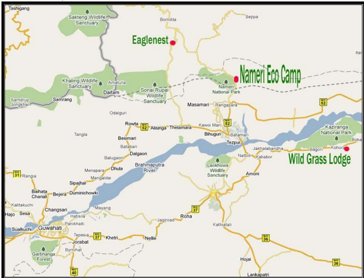
Map of the area (nicked from an other report), Kaziranga NP not visited. Dirang is to the NW of Eaglenest