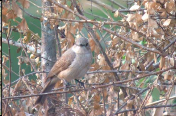
Gambaga Flycatcher, thanks to my guide one bird at M.P.