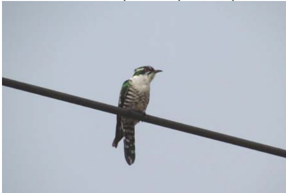
Diederik Cuckoo more heard than seen