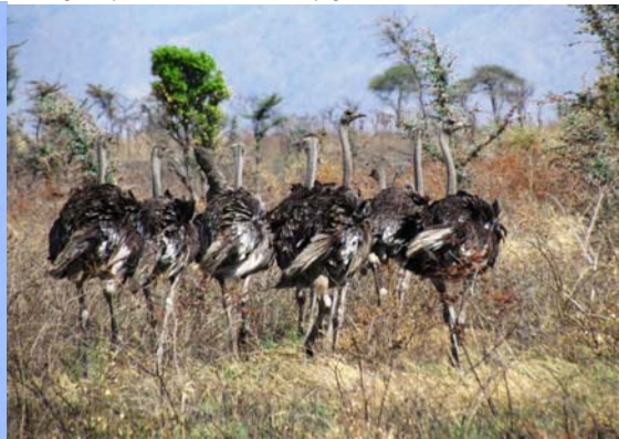
Ostrich, the right subspecies as a former breeder of the holarctic