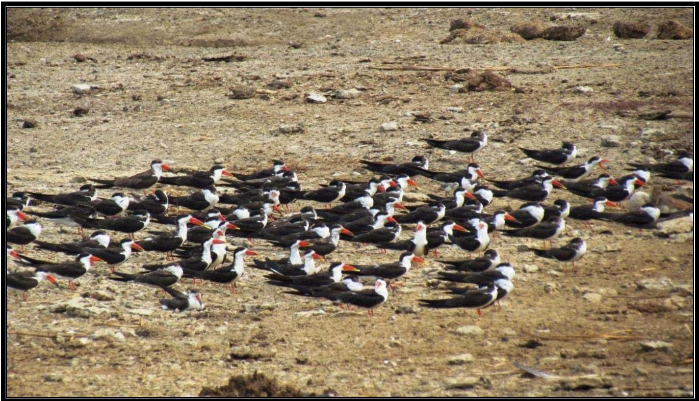
African Skimmers 22-01-2012, Queen Elisabeth NP.