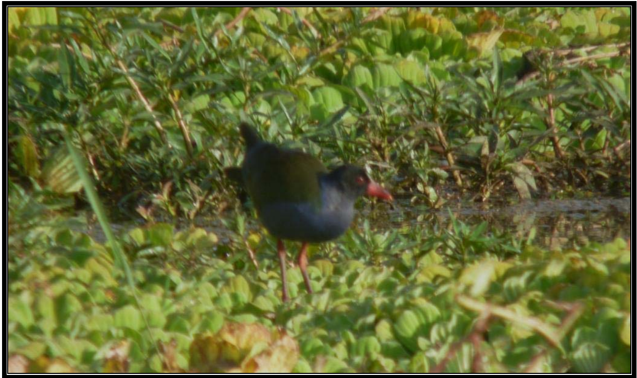
Allen's Gallinule on a small pond at Kidepo was a surprise at this site (and not in focus because of the heat haze)