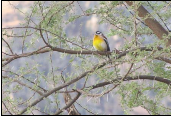
Golden-breasted Bunting by Alfred Twinomujuni.