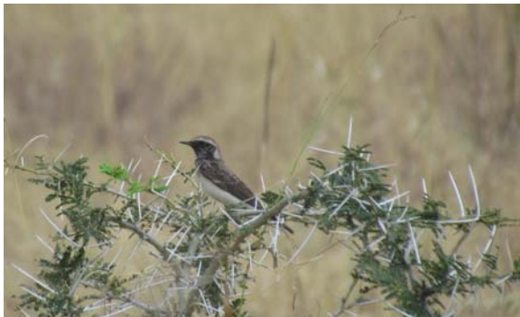
Pied Wheatear a winter bird at Apoka lodge, Kidepo