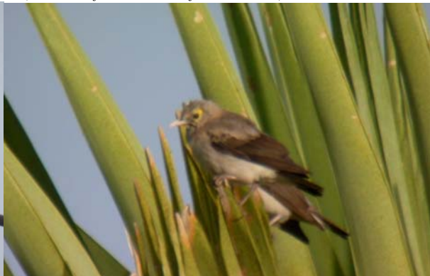
Wattled Starling at Kidepo