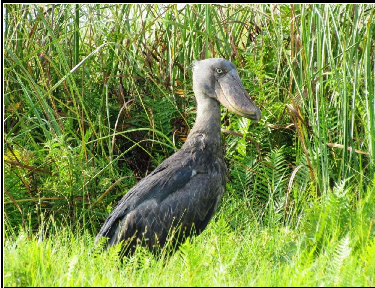
Shoebill near Entebbe, a wonder that this species still is walking around on this earth.....