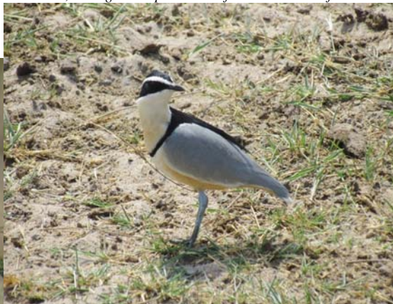
The surprise of the trip, this former breeder of Egypt(ian Plover)