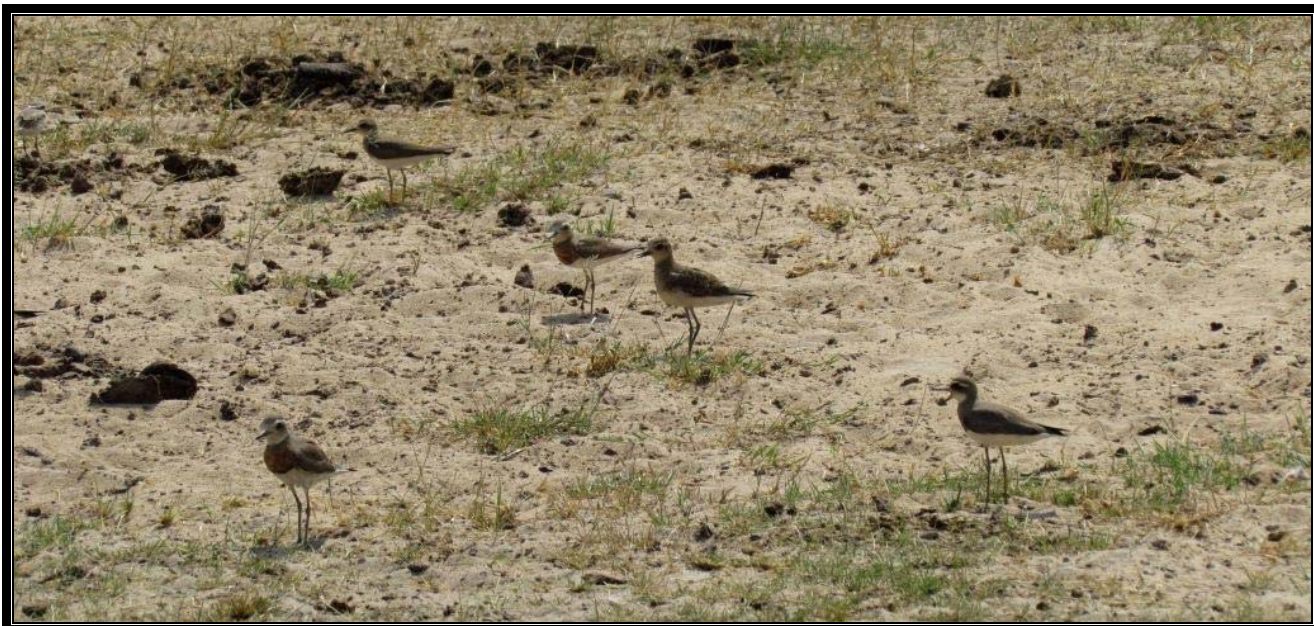
Caspian Plovers where a nice find at M.P, two birds where coming into summer plumage