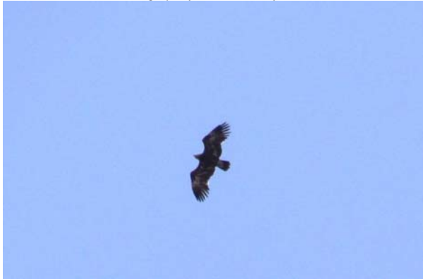
Spotted Eagle The first for the country..