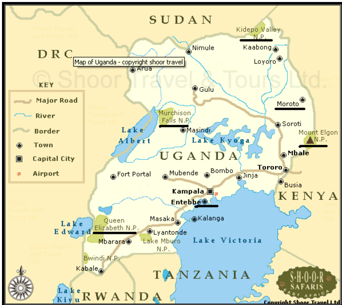
Map of the visited area's during the trip.