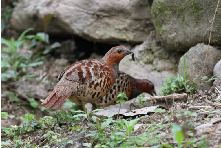
The birds by Tang Jun