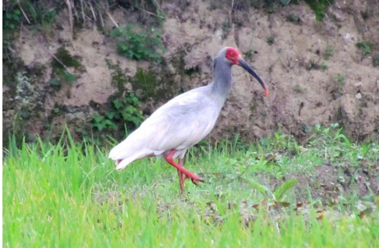
Crested Ibis, feeding in the rice fields and very shy

A total of at least 11 birds in a small colony in a village close to (3 Km) CH. Seen sleeping in trees and feeding in the rice fields. One bird seen near the breeding center in flight. Heard calling, many birds where in the grayish breeding plumage.