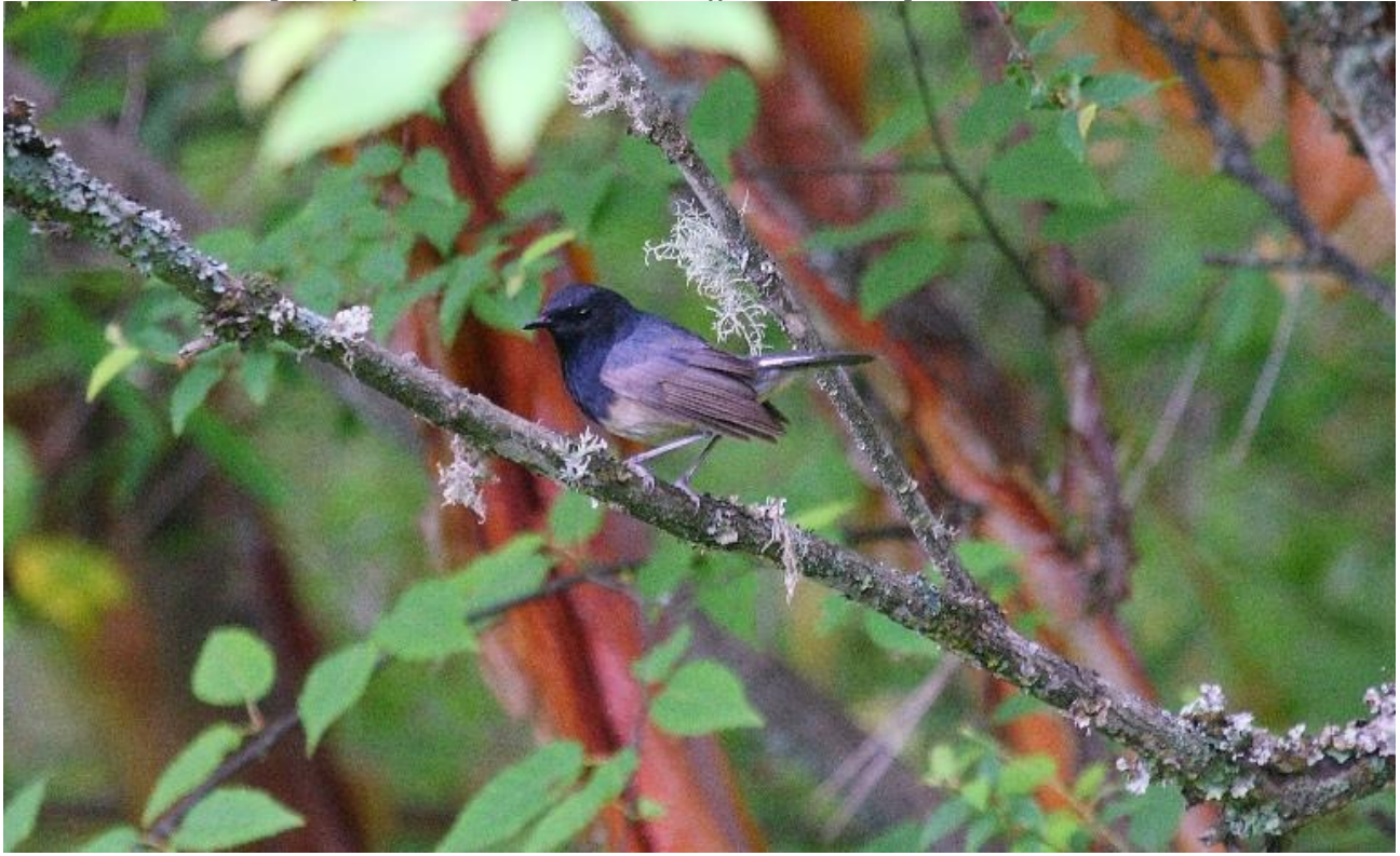
THE male Blackthroat a week earlier

A report of a short trip to see two difficult Robin species in China.