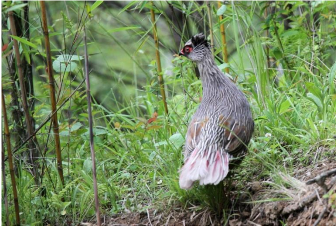
Blood pheasant, quite common by Tang Jun

A total of 3 birds seen well at CH, often first found on call.