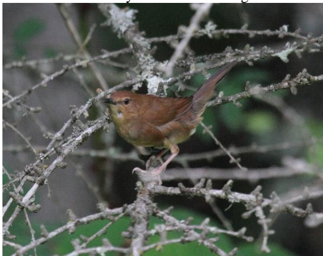
Russet Bush Warbler, giving nice views by Zang Yongwen

14-06 2 ex. seen very well while having lunch at CH