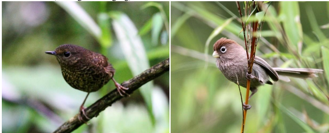
The Pygmy wren by Tang Jun not totally in focus, but good enough for me. Spectacled Parrotbill by Tang Jun, the commonest forest Pb.

2 birds heard (calling and singing) at JZ and one of them seen very well.